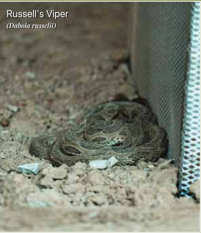
Russell's Viper (Daboia russelii)