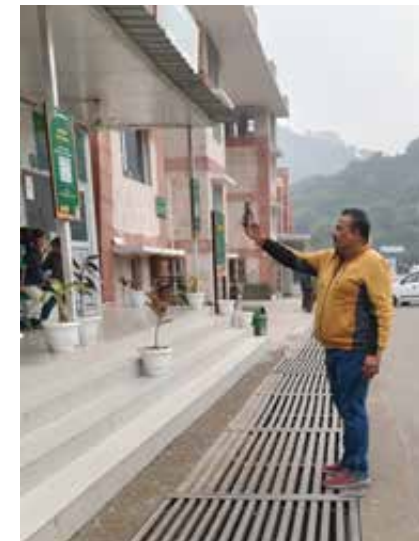
A visitor scanning QR code for hassle free ticket booking at Jambu Zoo.

Jambu Zoo has successfully implemented a cutting-edge ticketing system, featuring a fully online ticketing and parking ERP system. This highly advanced system, developed with state-of-the-art technologies, places a strong emphasis on total transparency and aims to eliminate revenue loss. Real-time monitoring and reporting of ticket sales ensure efficient operations, while the user-friendly interface enhances the overall experience. The scalable nature of the system allows it to adeptly handle high visitor turnout, reflecting Jambu Zoo's commitment to modern, efficient, and visitor-friendly management practices.