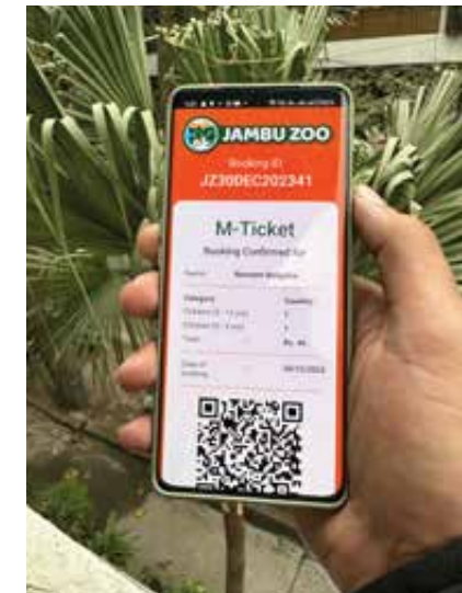
Zoo ticket Directly generated on the mobile after online booking