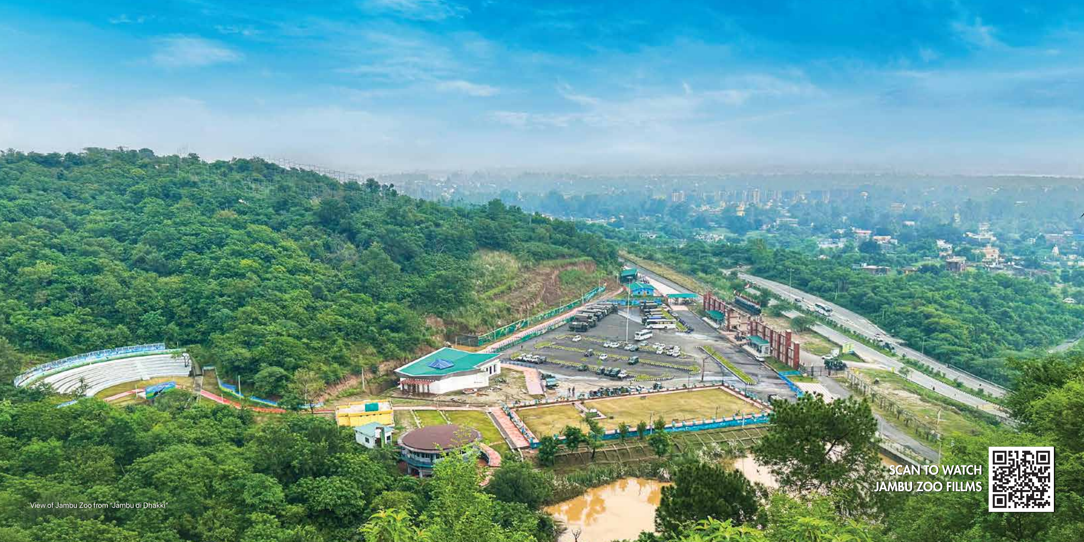
View of Jambu Zoo from "Jambu di Dhakki"