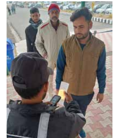
Security Guard authenticating the ticket before entry