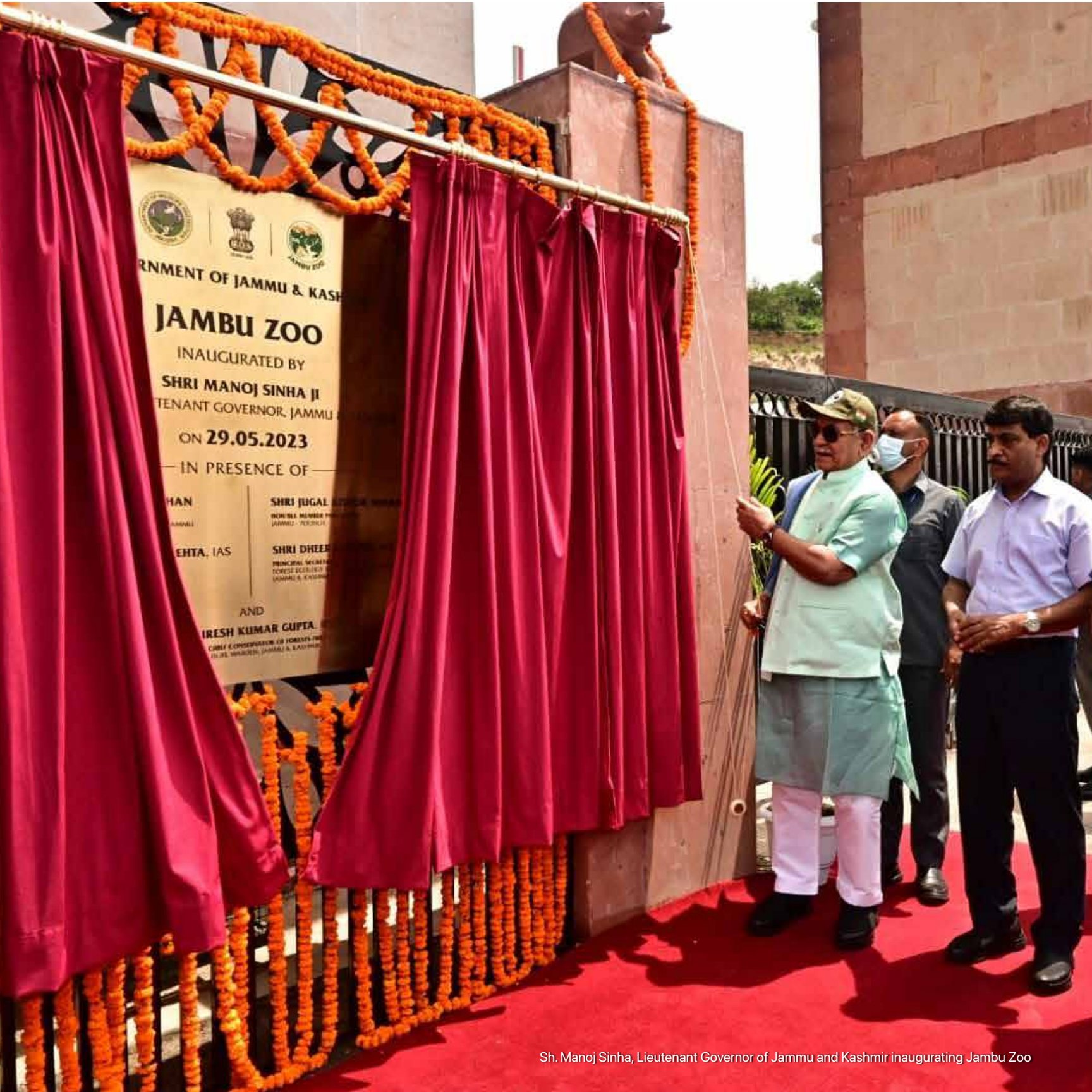
Sh. Manoj Sinha, Lieutenant Governor of Jammu and Kashmir inaugurating Jambu Zoo