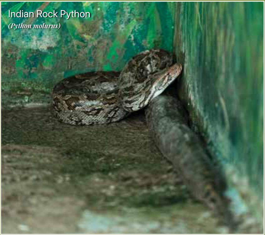
Indian Rock Python (Python molurus)