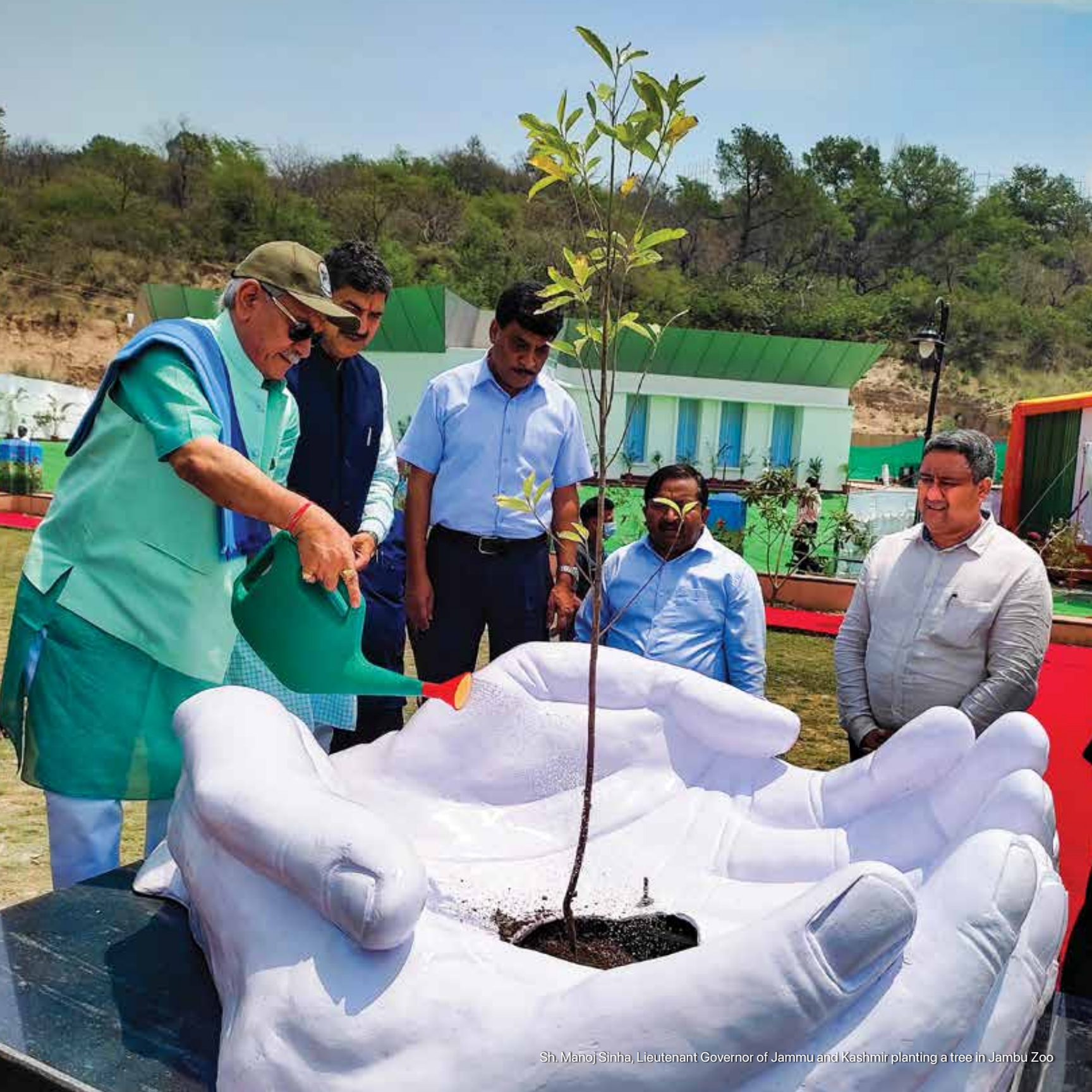
Sh. Manoj Sinha, Lieutenant Governor of Jammu and Kashmir planting a tree in Jambu Zoo