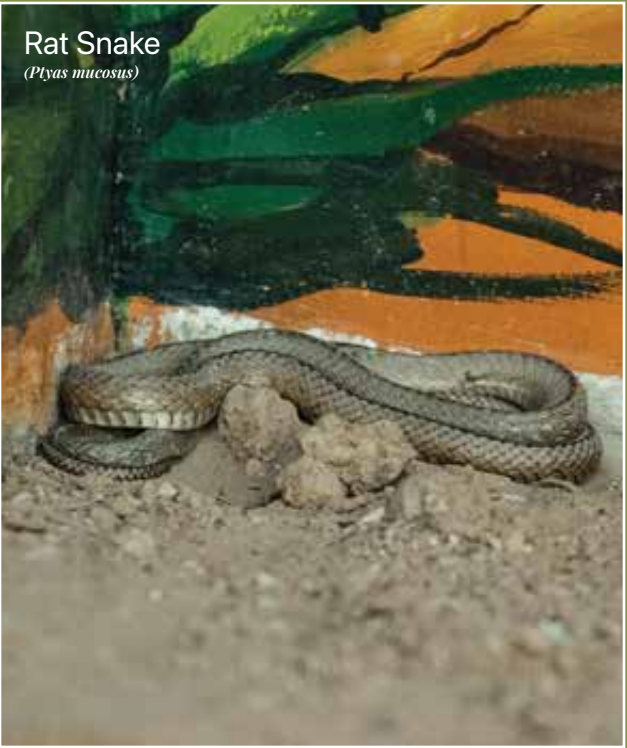
Rat Snake (Ptyas mucosus)