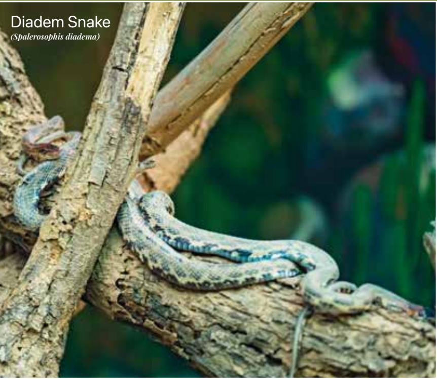
Diadem Snake (Spalerosophis diadema)