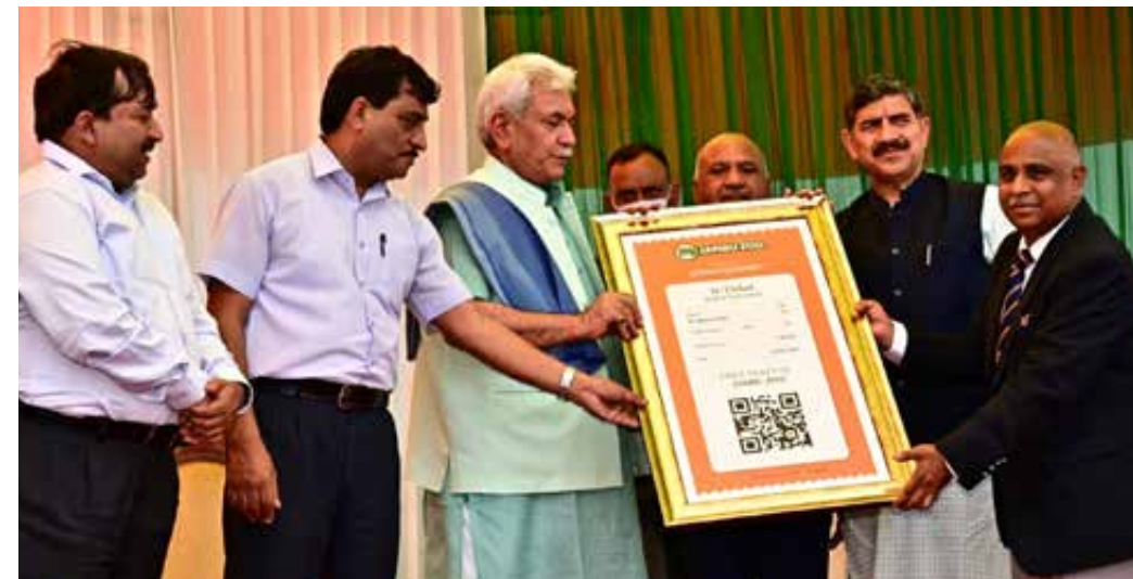
Memento of first Jambu Zoo ticket being offered to Sh. Manoj Sinha, Lieutenant Governor of Jammu and Kashmir.